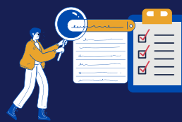
Information on Singapore's business environment and regulations